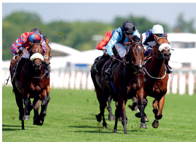
Asfoora winning the King Charles III Stakes on Day 1 of Royal Ascot 2024