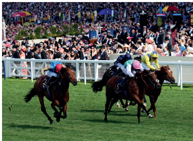
Haatem winning the Jersey Stakes on Day 5 of Royal Ascot 2024